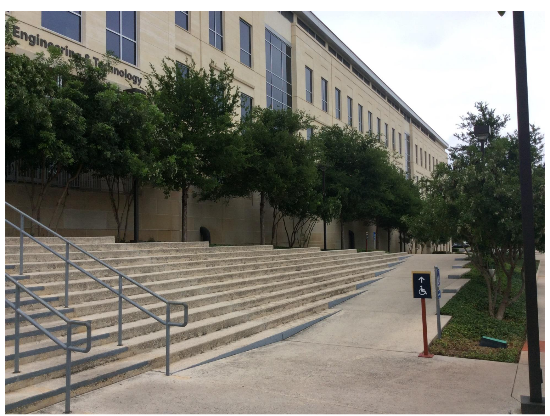
ADA Path (switchback) located in front of AET from Ximenes Ave. Lot