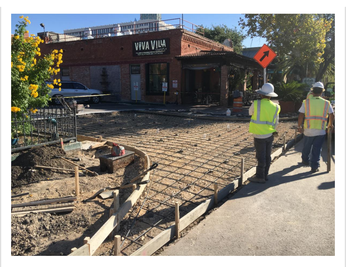
Driveway approach forming at Viva Villa