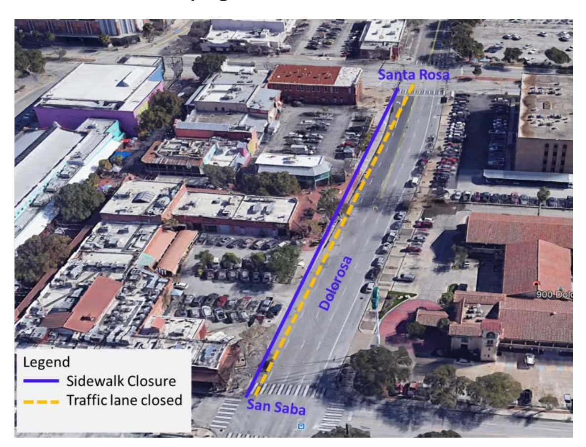
Market Square Sidewalk & Lane Closure