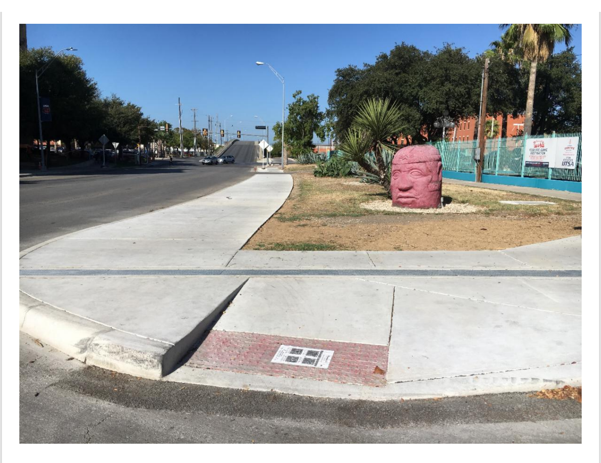
Wheel chair ramps at Buena Vista & S. Leona