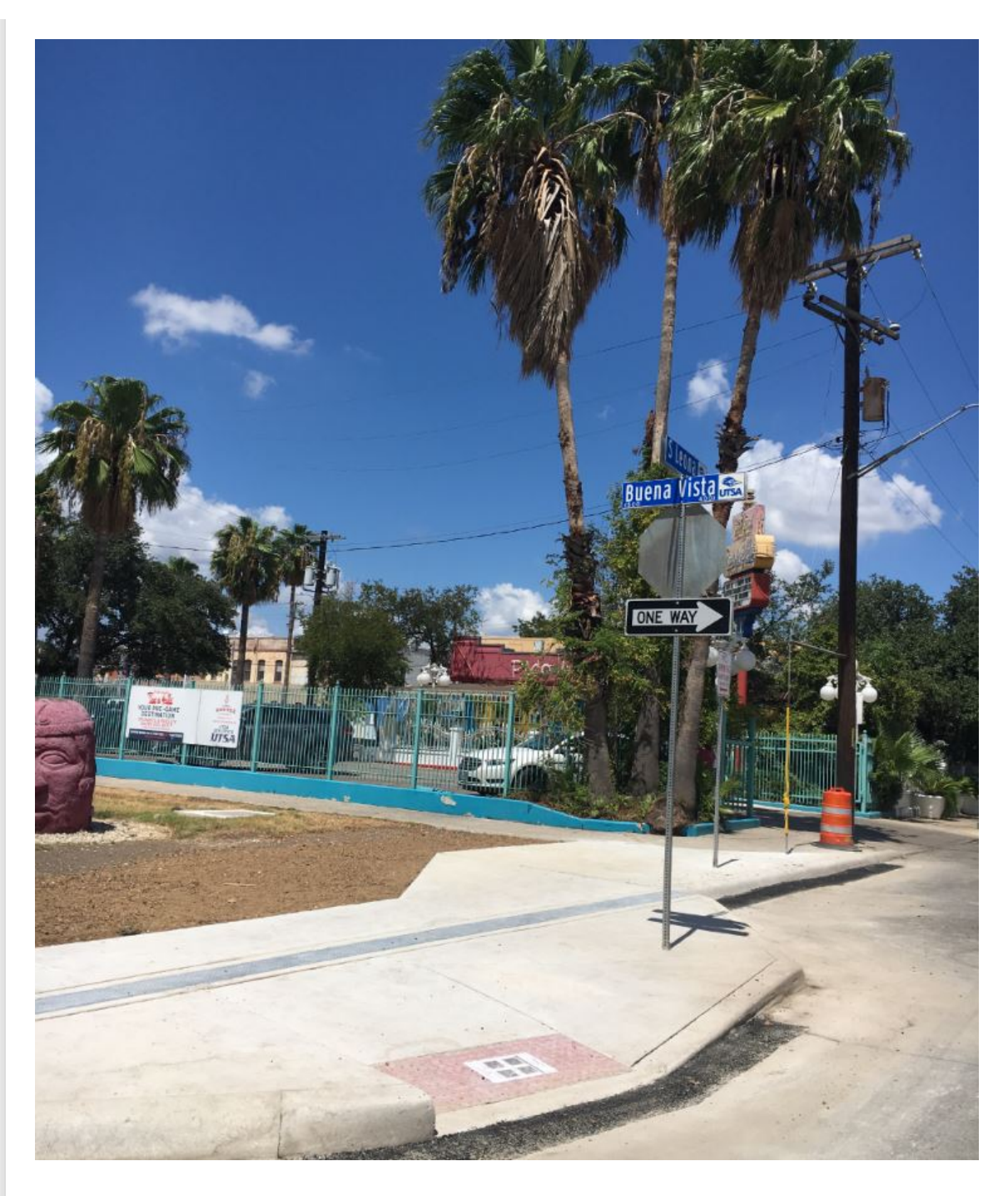
New curb, sidewalk and wheel chair ramps at Buena Vista & S. Leona northwest intersection