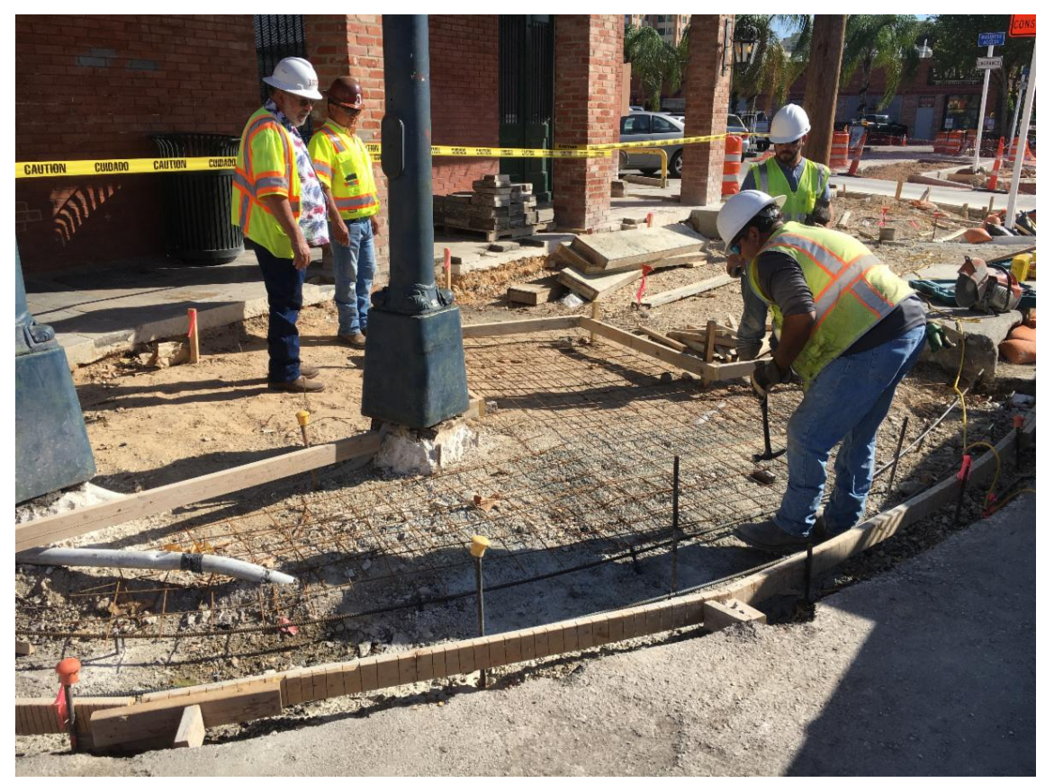
Sidewalk and wheel chair ramp forming at San Saba & Dolorosa