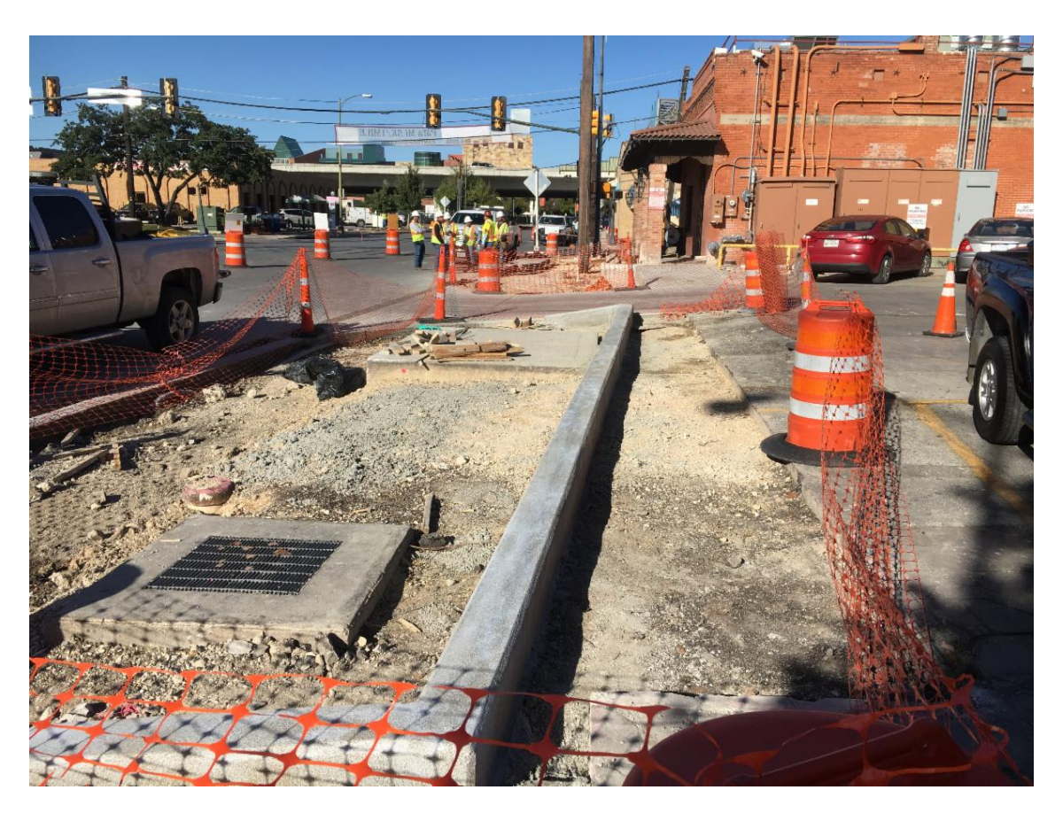
Right of way excavation