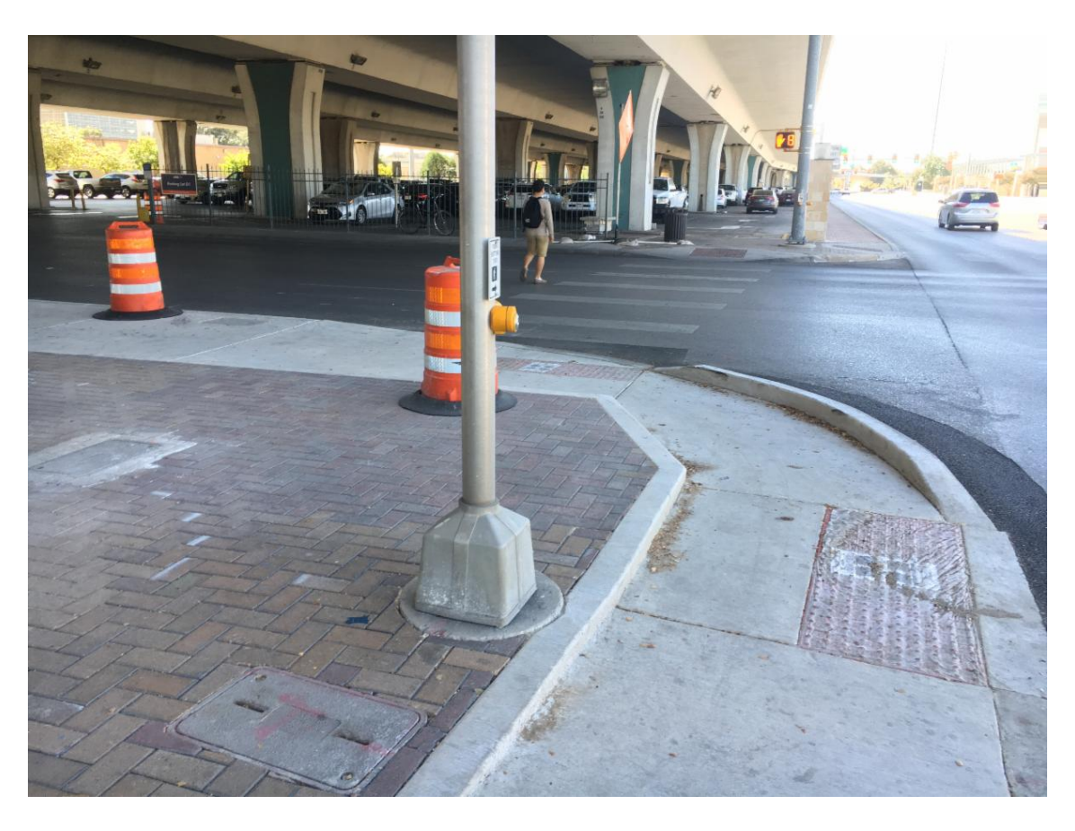
Wheel chair ramps at IH-35 & N. Pecos northeast side