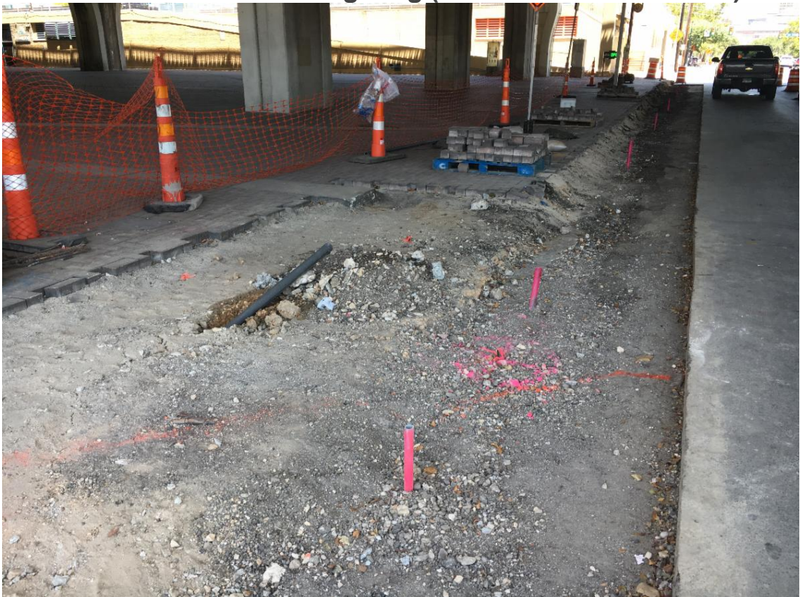
Electrical conduit installation for pedestrian lighting on Buena Vista (Under IH35)