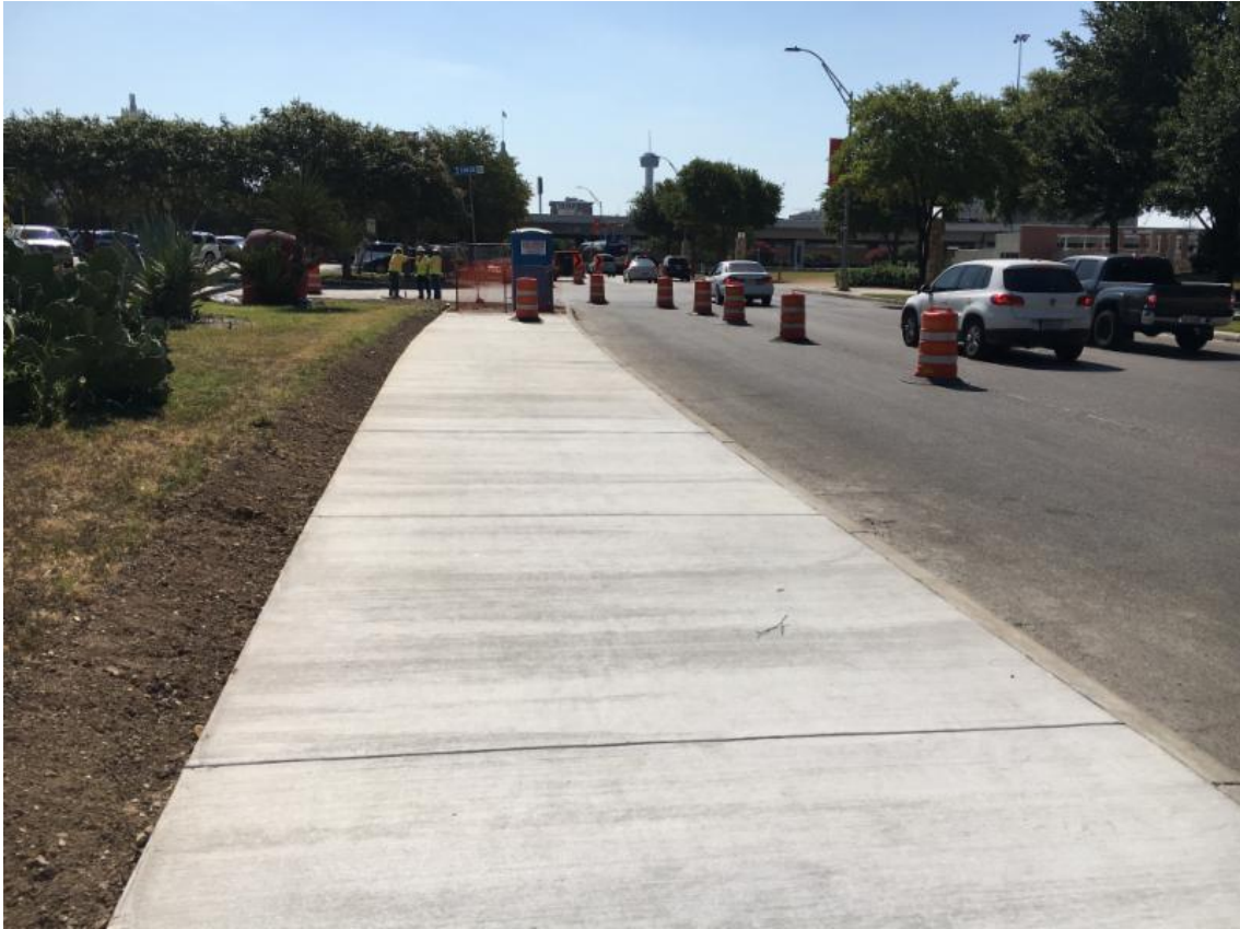
New sidewalk by Pico de Gallo restaurant