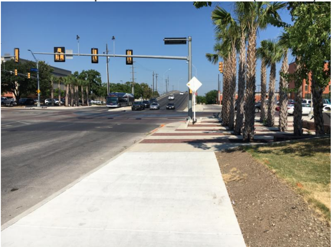
New sidewalk on Buena Vista connecting to S. Frio