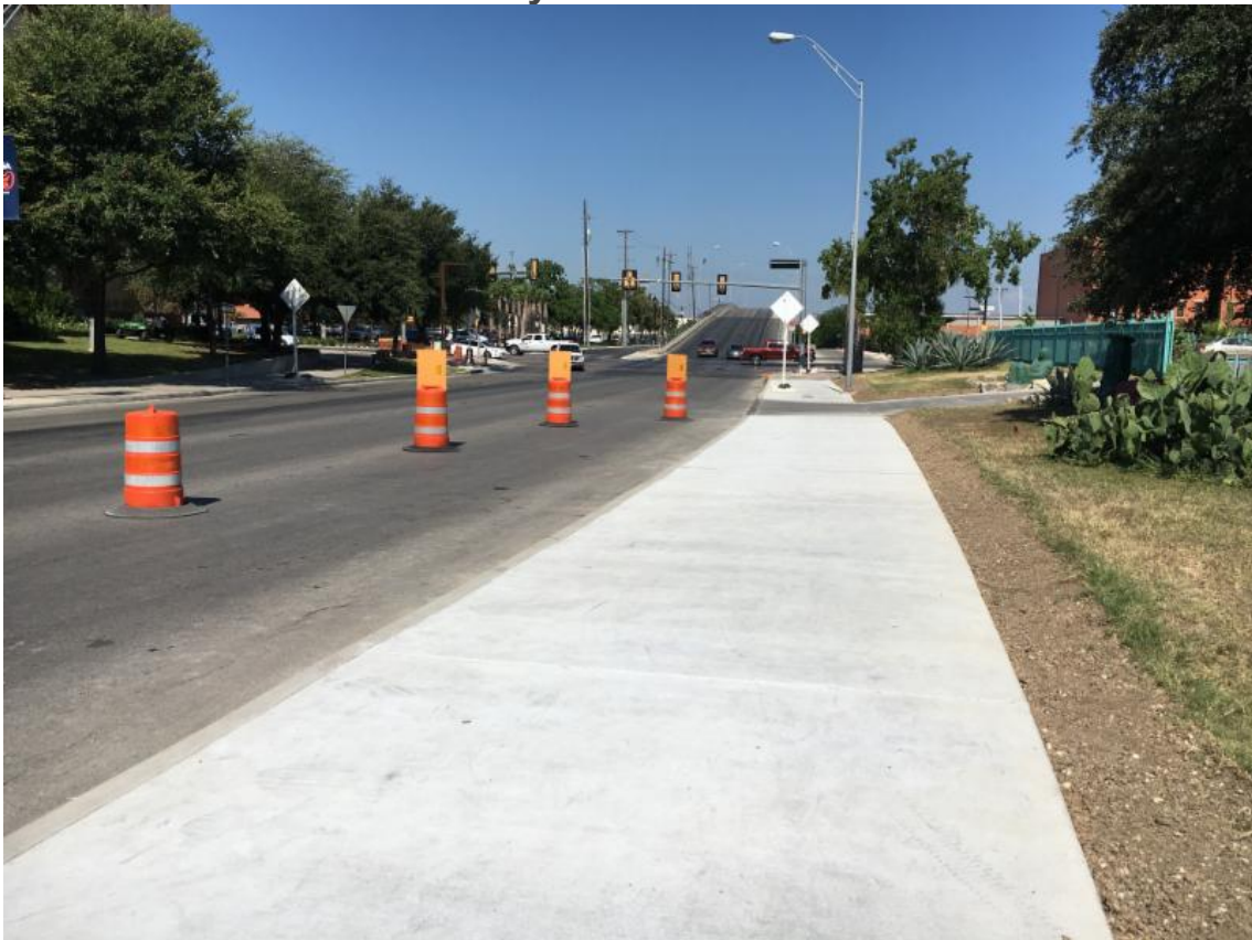
New sidewalk by Pico de Gallo restaurant

**PLEASE NOTE: ALL WORK IS SUBJECT TO FAVORABLE WEATHER CONDITIONS**