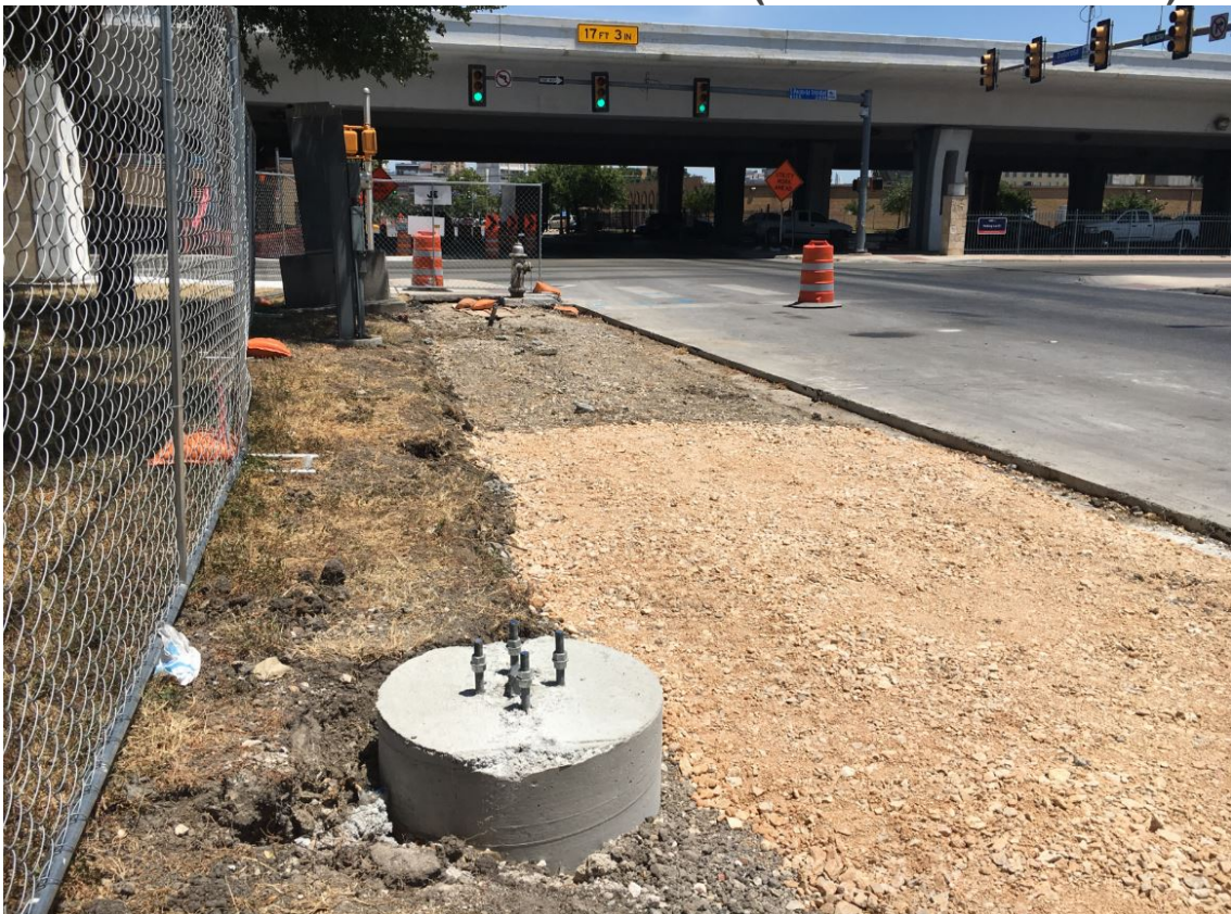
Concrete footing for pedestrian lighting formed on Buena Vista (S. Leona to N. Pecos)