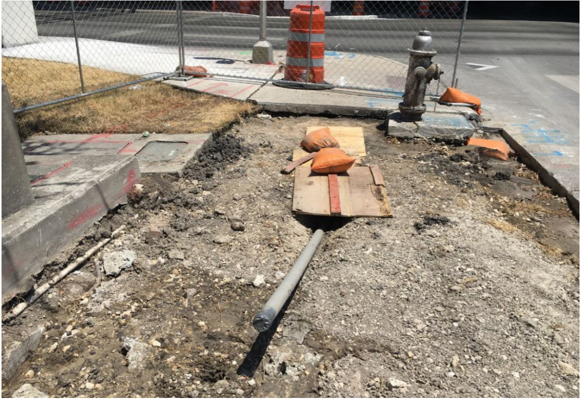
Electrical conduit for lighting (Buena Vista & N. Pecos)