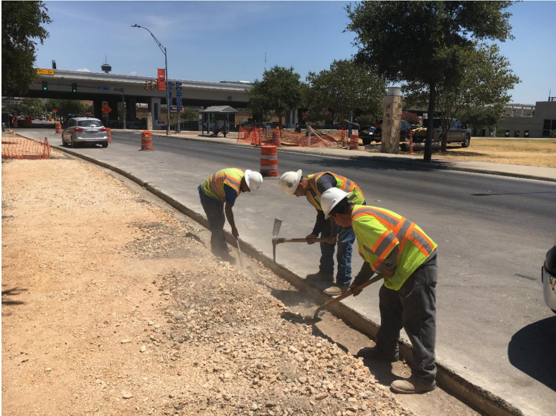
Excavation for curb on Buena Vista (S. Leona to N. Pecos)