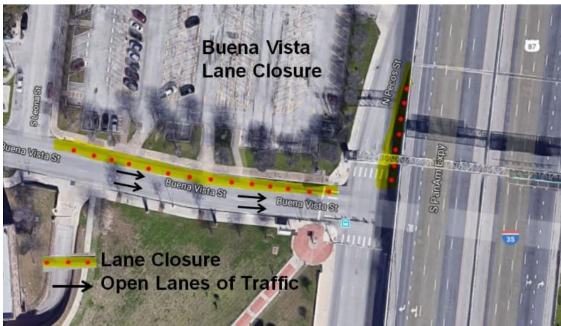
Buena Vista Lane Closure