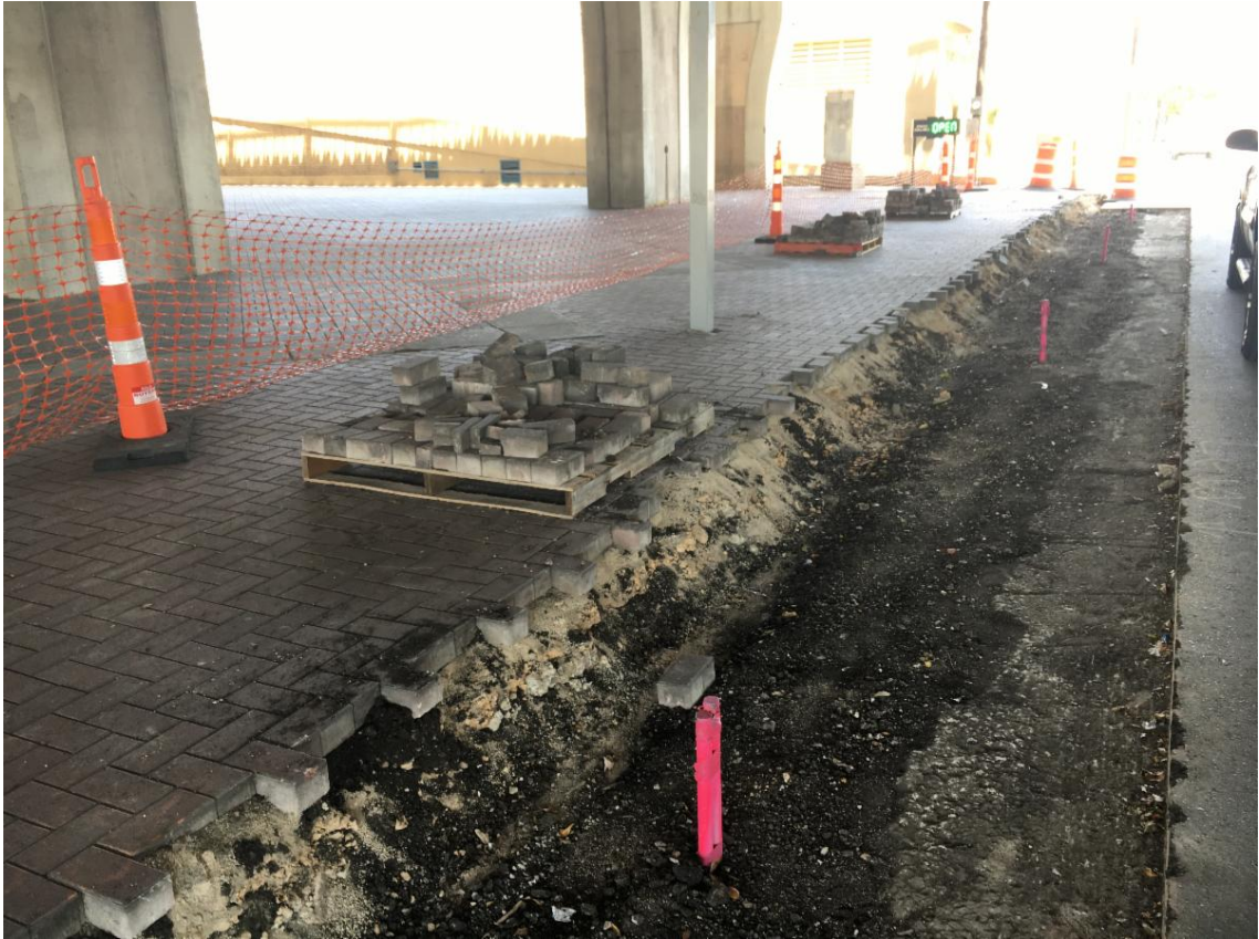
Curb and brick paver removal on Buena Vista (Under IH35)