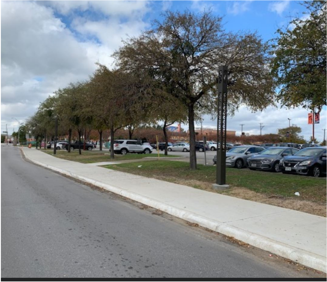
Pedestrian lighting at Buena Vista