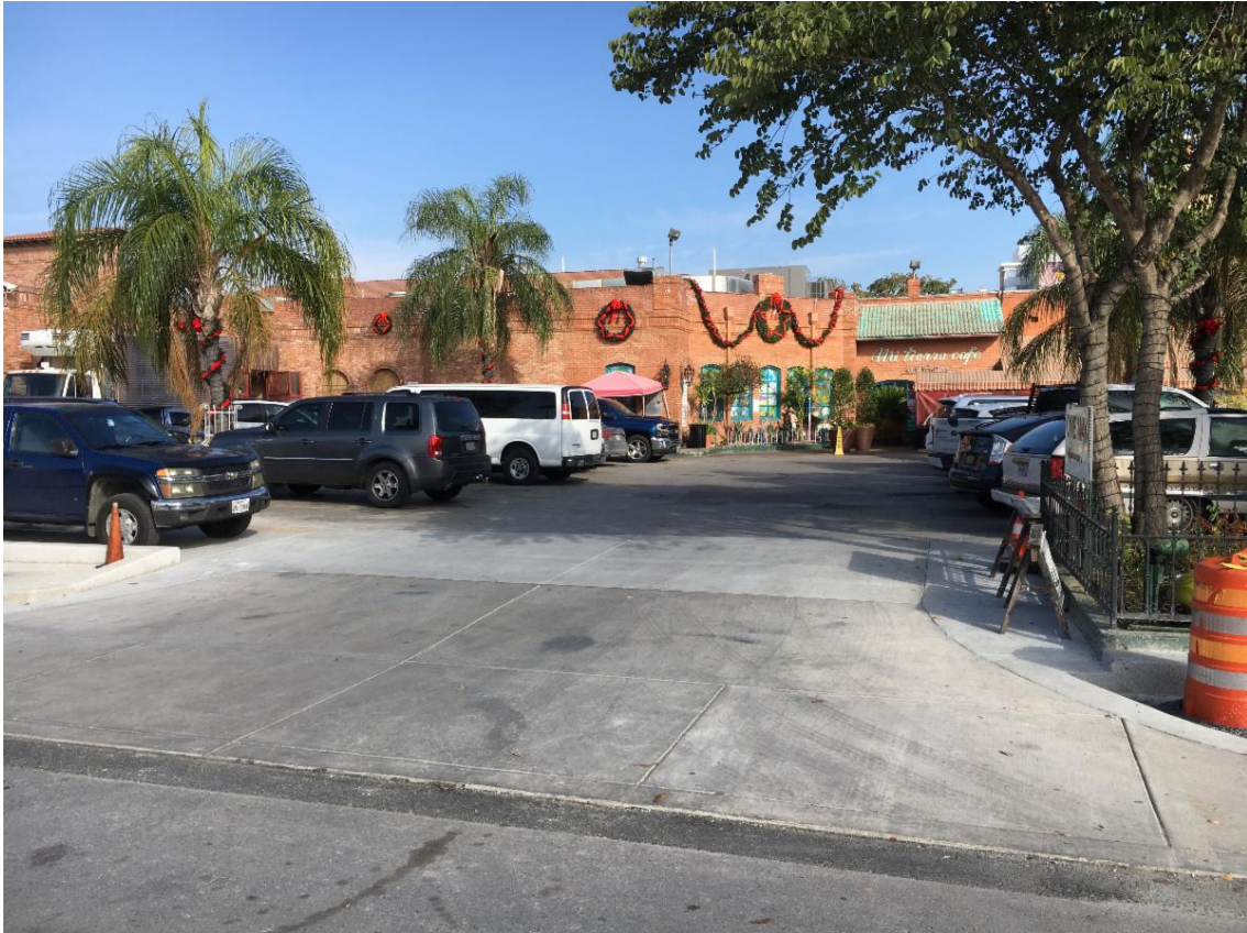
Completed driveway No. 2 at Mi Tierra