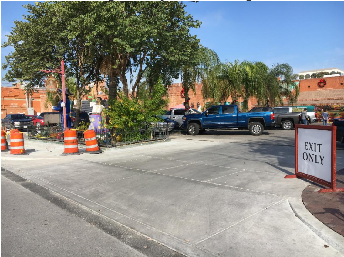
Completed driveway No. 3 at Mi Tierra