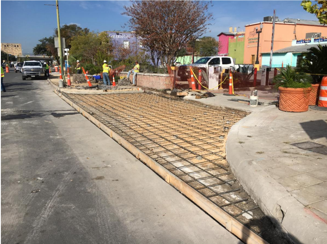
Forming driveway No. 5 at La Magarita