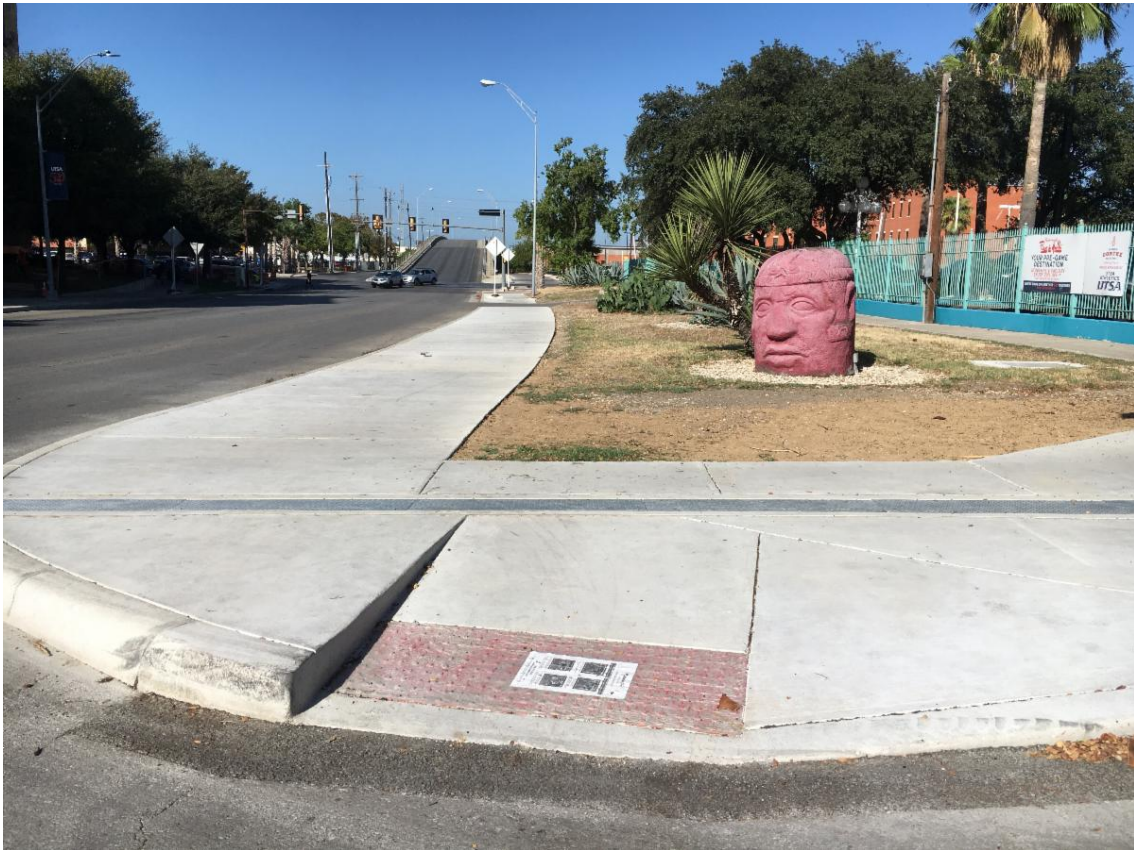
Wheel chair ramps at Buena Vista & S. Leona