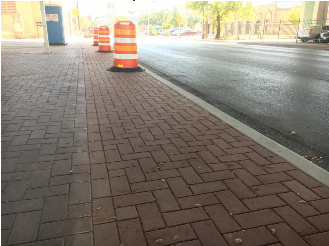
Brick pavers completed (Under IH-35)