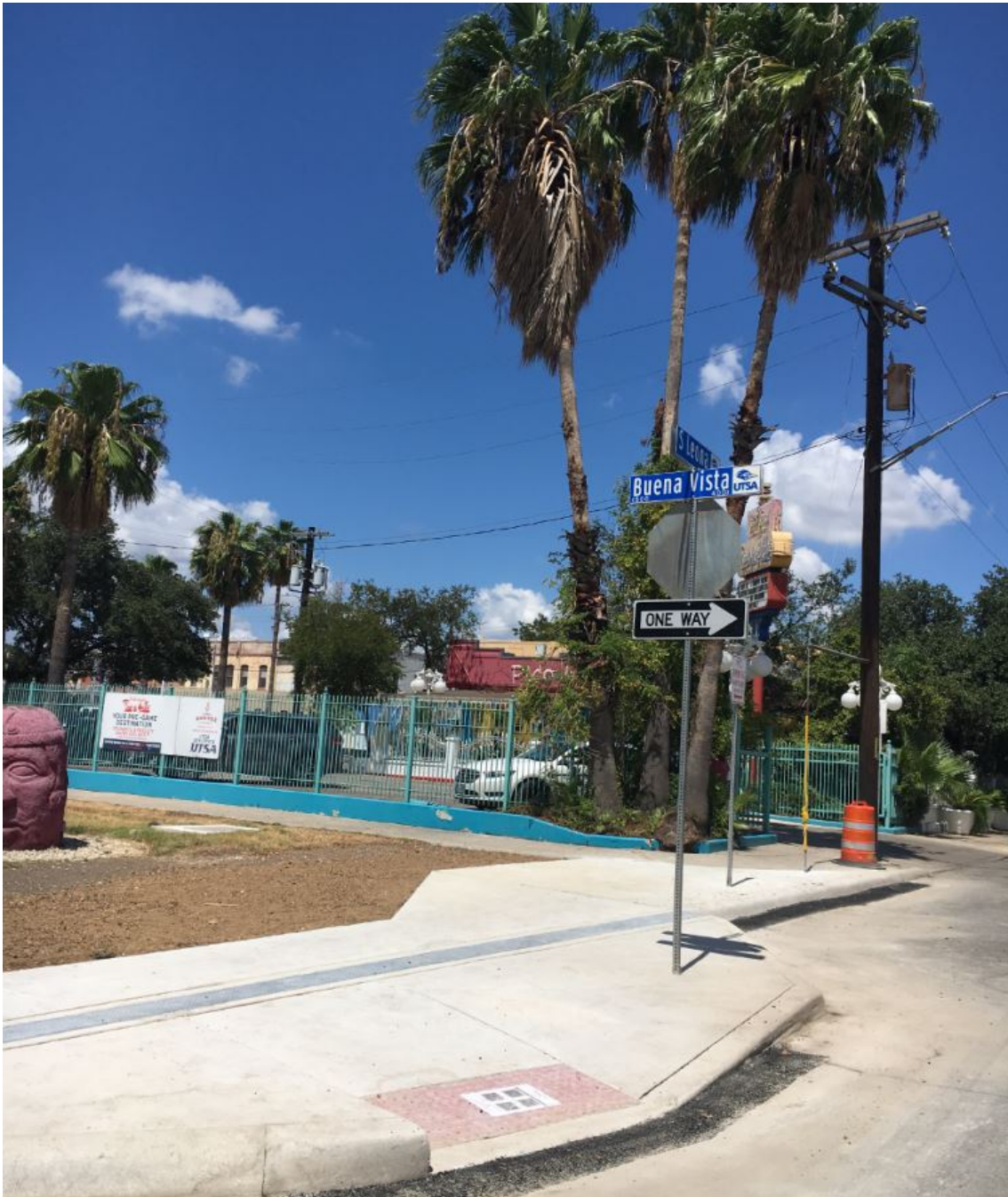
New curb, sidewalk and wheel chair ramps at Buena Vista & S. Leona northwest intersection