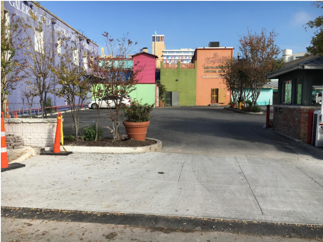
Completed driveway No. 4 at La Magarita