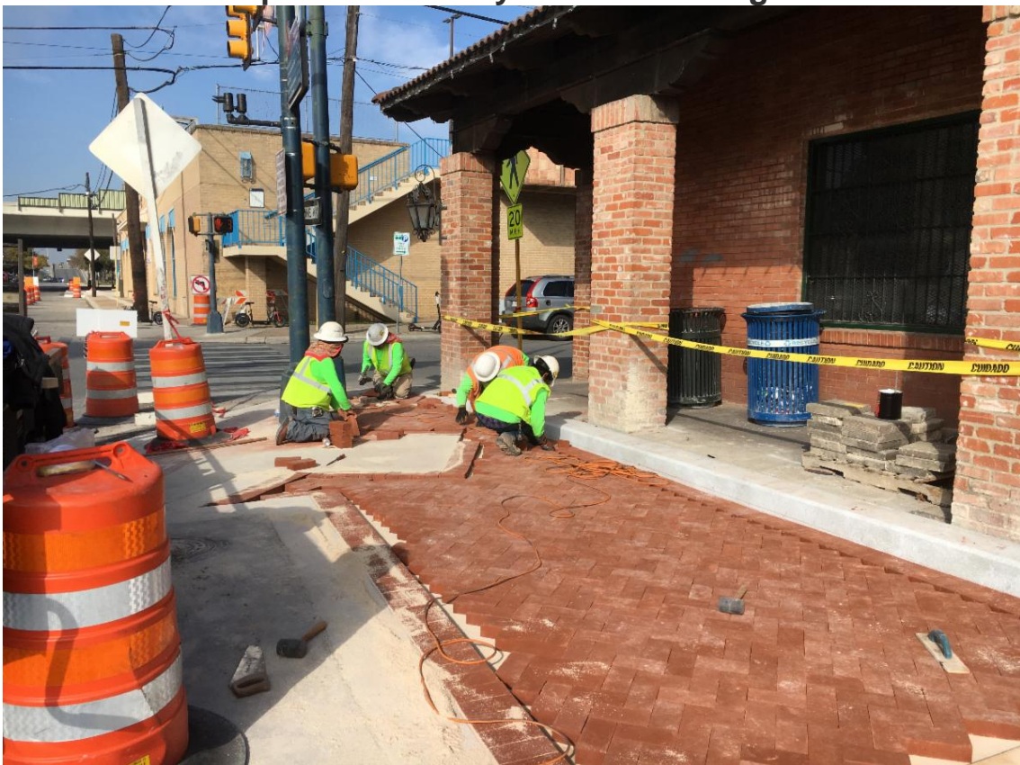
Brick paver replacement on Dolorosa