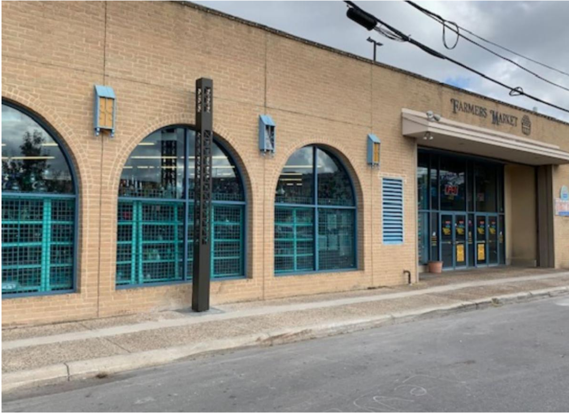
Pedestrian lighting at Farmers Market