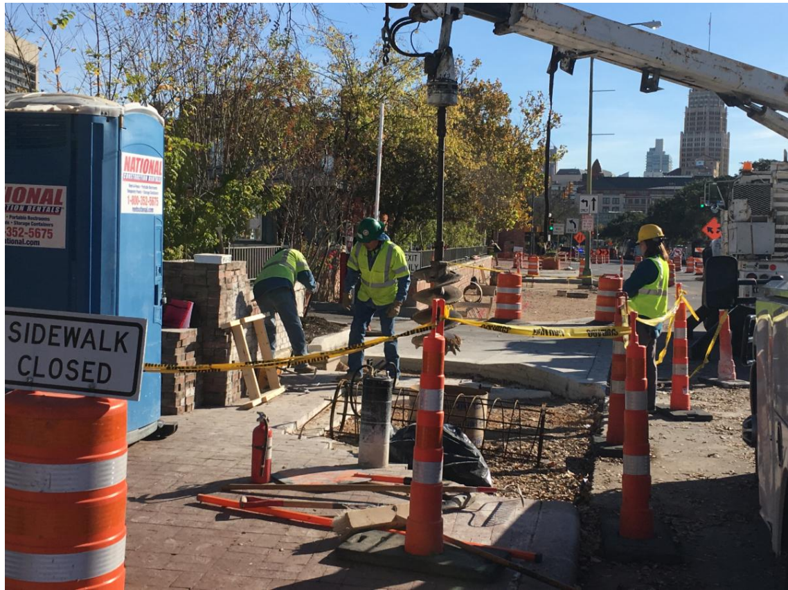
Drilling footings for pedestrian lights at La Margarita