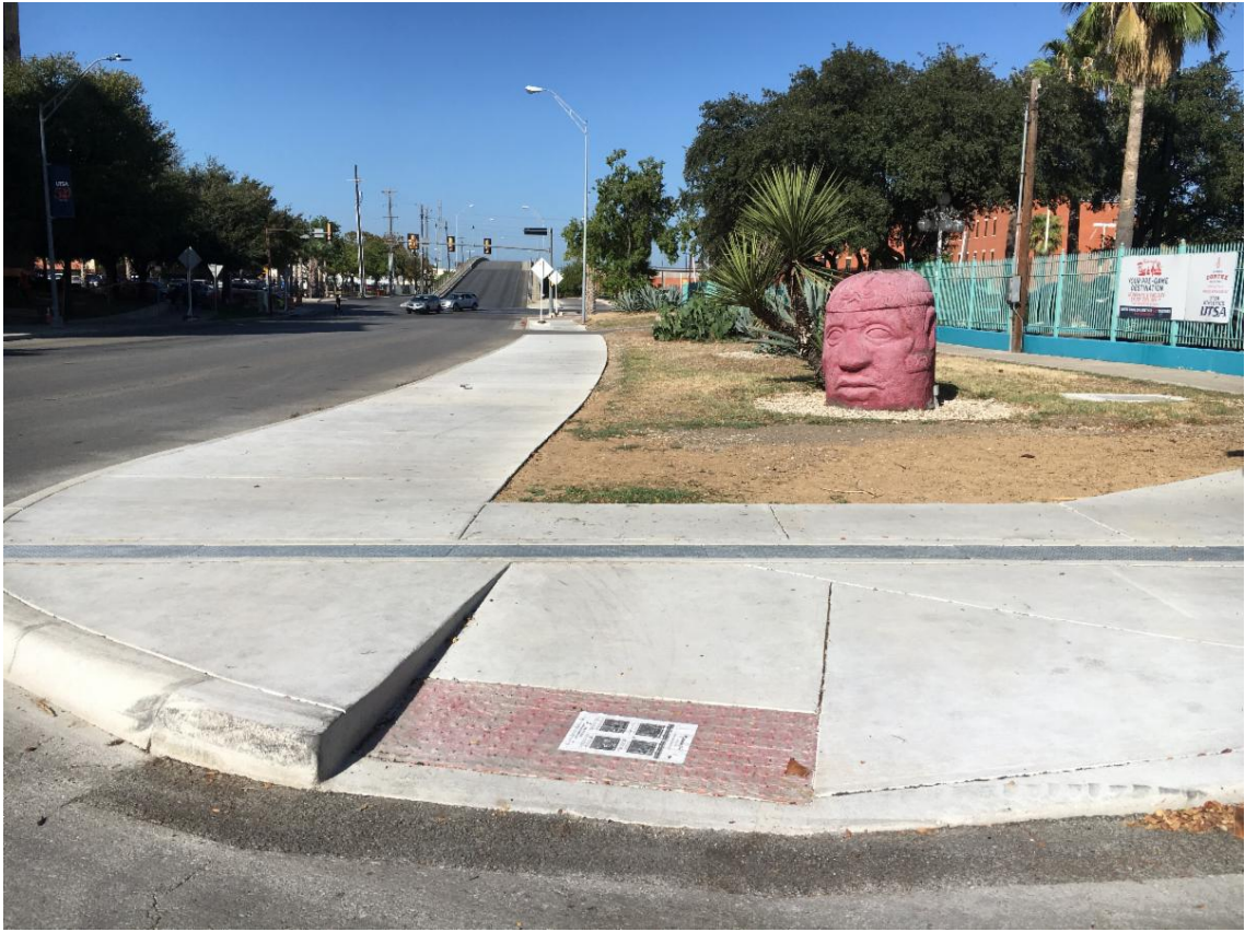
Wheel chair ramps at Buena Vista & S. Leona