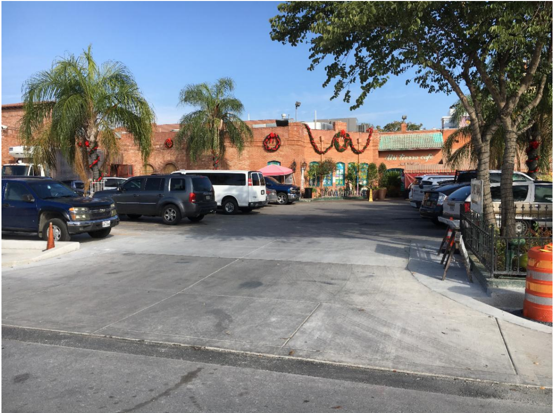
Completed driveway No. 2 at Mi Tierra