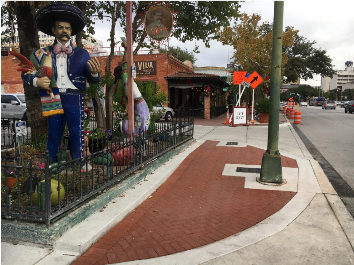
New brick pavers at Mi Tierra