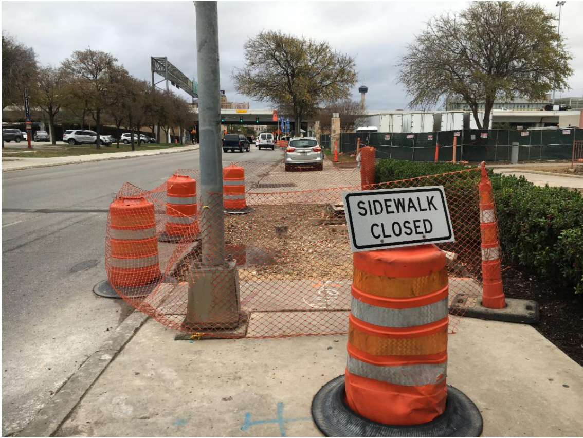
Excavation for wheel chair ramp at Buena Vista & S. Leona