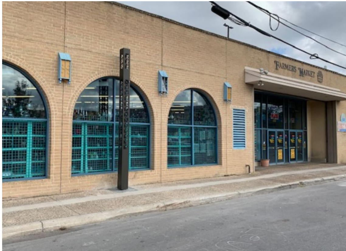
Pedestrian lighting at Farmers Market