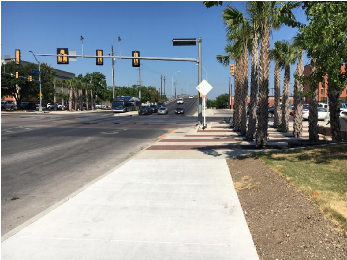
New sidewalk on Buena Vista connecting to S. Frio