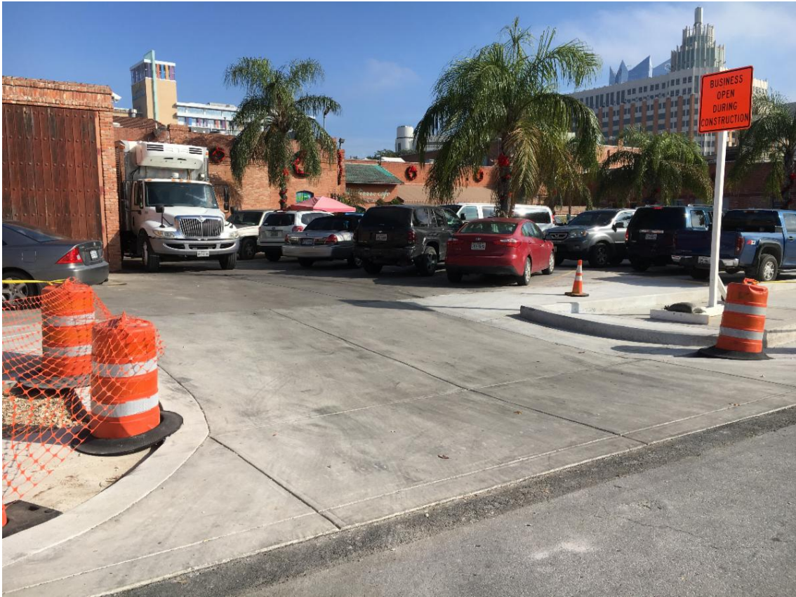
Completed driveway No. 1 at Mi Tierra