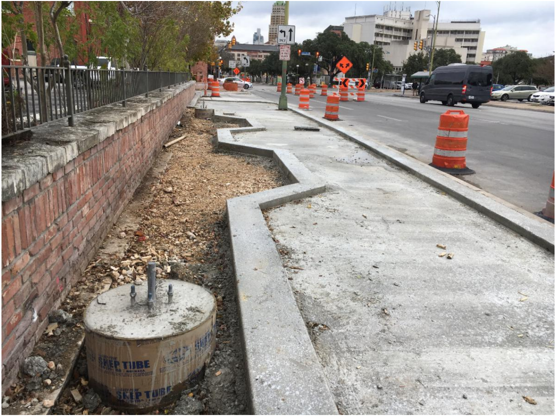
Preparing for brick pavers and pedestrian lights at La Margarita