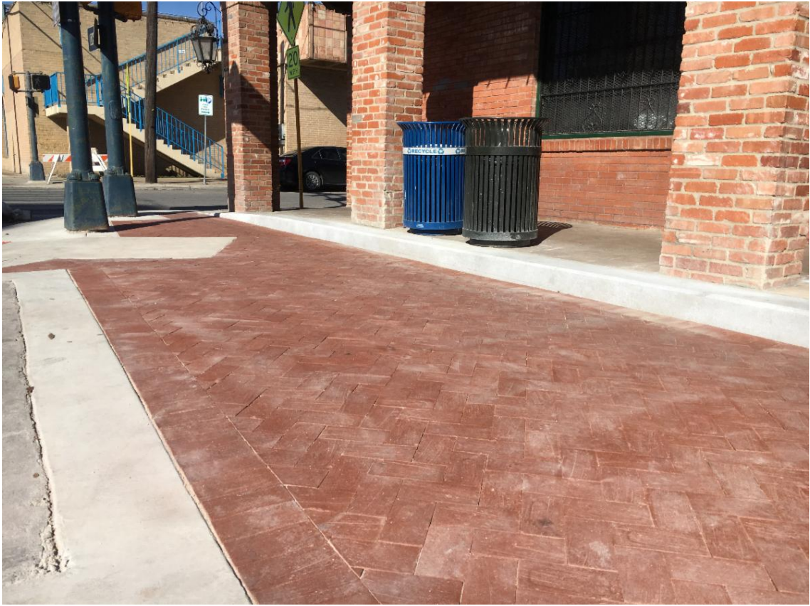
New brick pavers at Mi Tierra