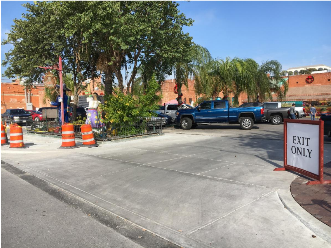
Completed driveway No. 3 at Mi Tierra