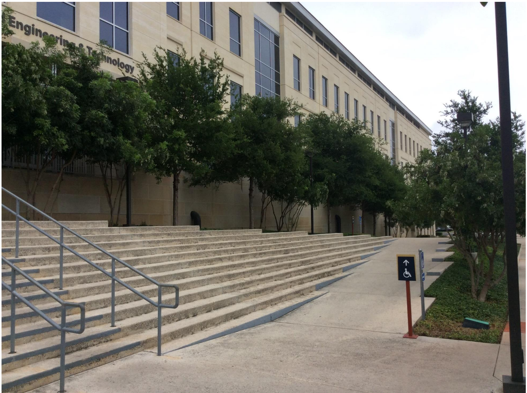
ADA Path (switchback) located in front of AET from Ximenes Ave. Lot